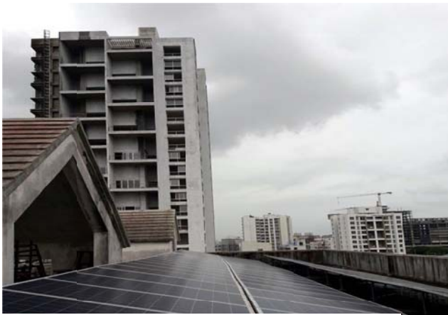
Balewadi Rd Latitude: 18.5746 Longitude: 73.7680 Note: G.S.MOZE COLLEGE OF ENGINEERING,BALEWADI,PUNE-45