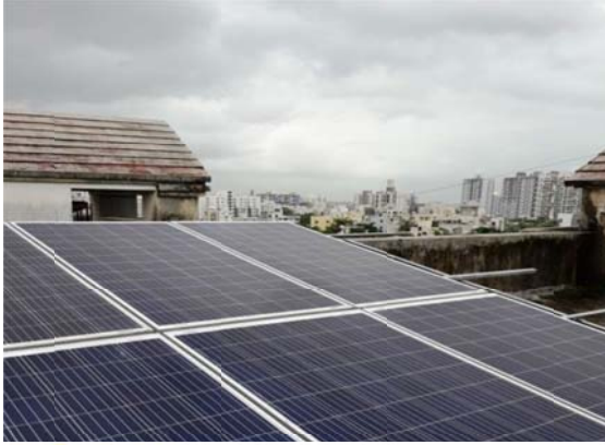
Balewadi Rd Latitude: 18.5746 Longitude: 73.7680 Note: G.S.MOZE COLLEGE OF ENGINEERING,BALEWADI,PUNE-45