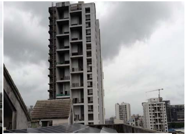
Balewadi Rd Latitude: 18.5746 Longitude: 73.7680 Note: G.S.MOZE COLLEGE OF ENGINEERING,BALEWADI,PUNE-45