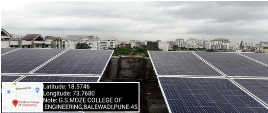
Balewadi Rd Latitude: 18.5746 Longitude: 73.7680 Note: G.S.MOZE COLLEGE OF ENGINEERING,BALEWADI,PUNE-45