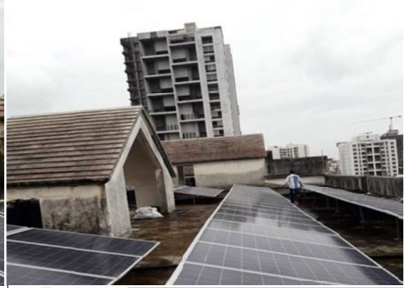
Balewadi Rd Latitude: 18.5746 Longitude: 73.7680 Note: G.S.MOZE COLLEGE OF ENGINEERING,BALEWADI,PUNE-45